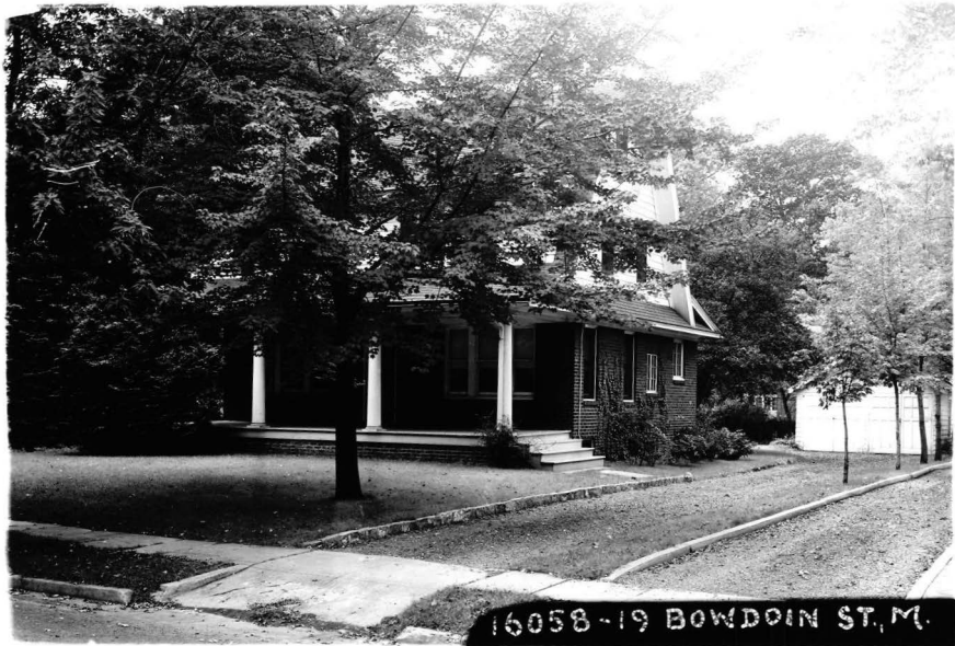
Board of Realtors of the Oranges and Maplewood.